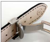
Step 5 Thread strap through