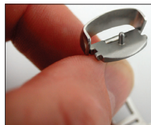
Step 4 Prise cover open