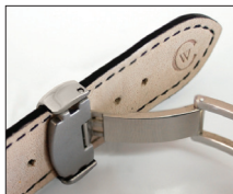
Step 6 Snap back