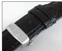
Step 8 Complete