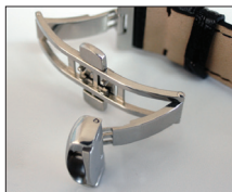
Step 3 Pull open clasp