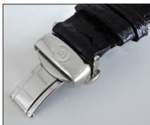
Step 1 Locate the clasp

Almost all strap versions of CW watches use quick-release butterfly clasps. If you are unfamiliar with the butterfly clasp system please follow our 8 step guide below.