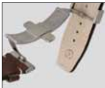
Step 6 Snap back