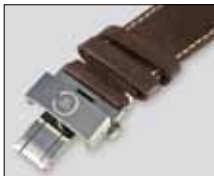
Step 1 The butterfly clasp

The strap versions of the C8 Pilot use quick-release butterfly clasps. If you are unfamiliar with the butterfly clasp system just follow our 8 step guide below.