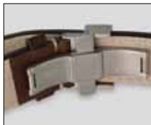
Step 7 Close clasp