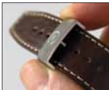
Step 5 Thread strap through