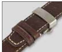
Step 8 Complete