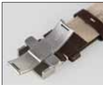
Step 2 Locate quick-release