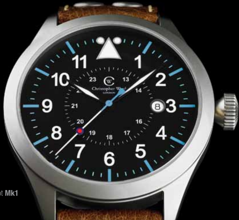
C8 Pilot Mk1