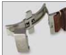
Step 4 Pull open clasp