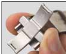
Step 3 Click quick-release