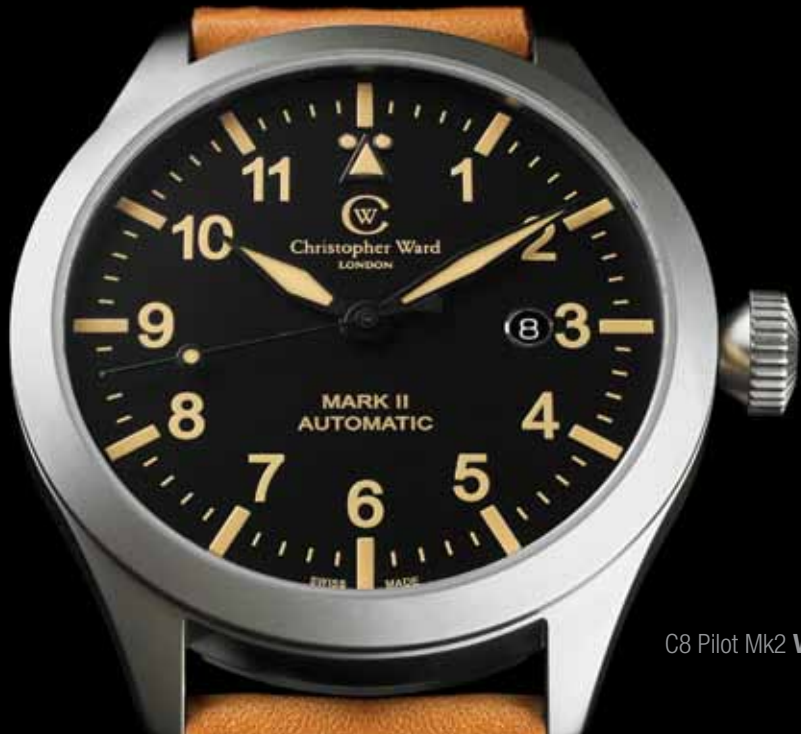
C8 Pilot Mk2 Vintage