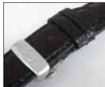
Step 8 Complete